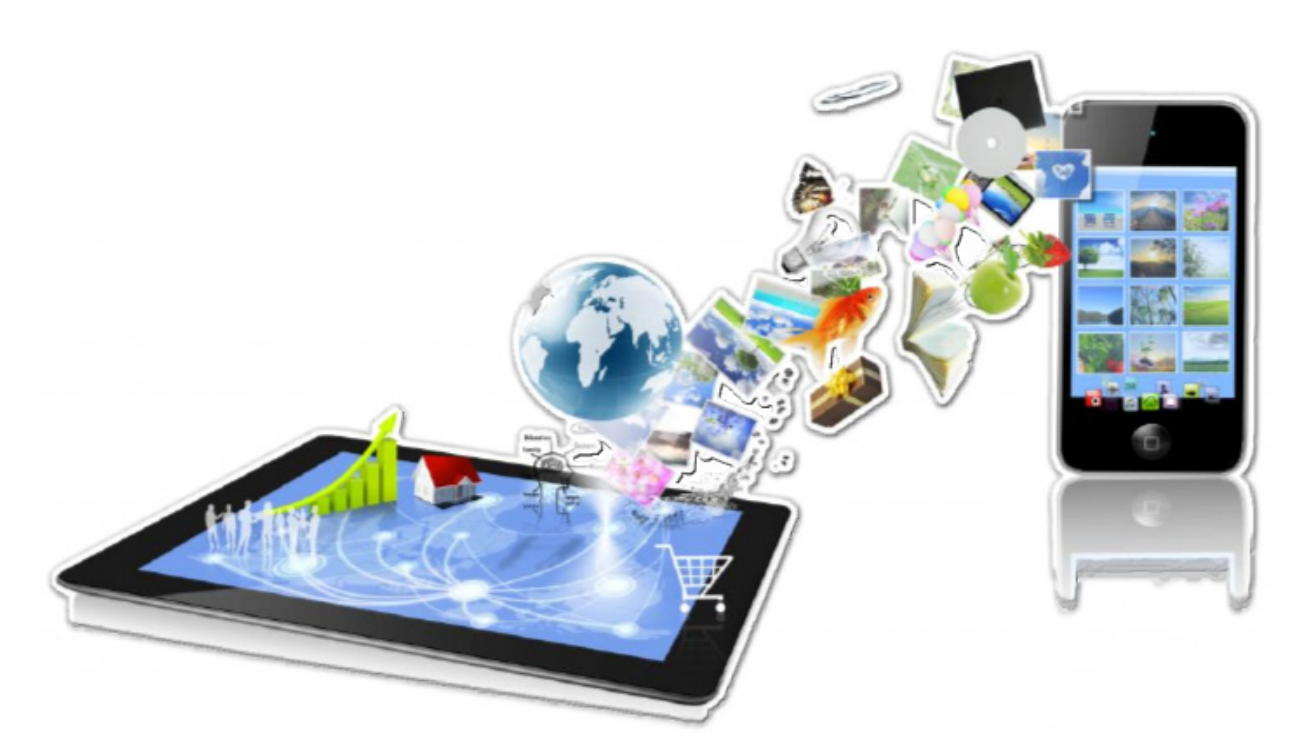
Figure 2: Enasbling applications for mobile