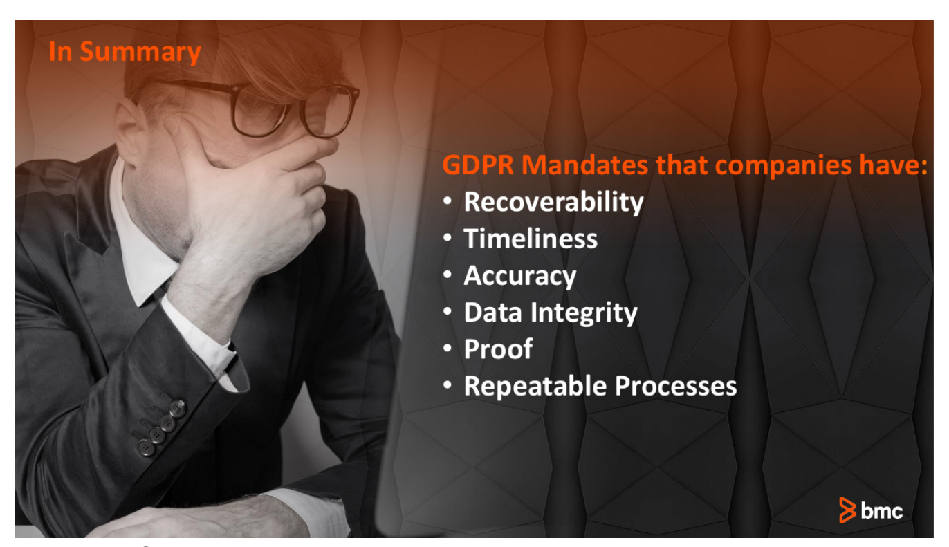
Figure 3: Summary