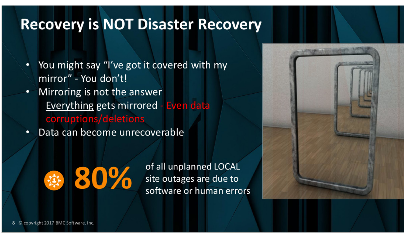
Figure 2: Recovery

isn't the case, it applies to any company that has data about a European Union (EU) citizen. So, it applies to data – and that's what IMS sites have a lot of! The bottom line is that GDPR will increase privacy and protection for individuals and give regulatory authorities greater power to take action against businesses that breach the new laws.